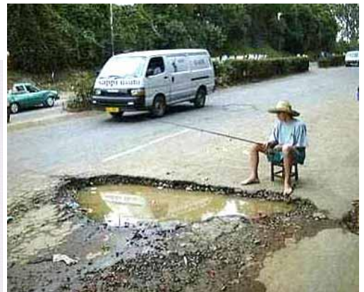
"Smile a little Smile"