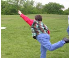
Form is important !!!!