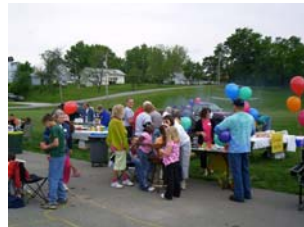
Helium balloons and Tug-o-war were the fare for the kids