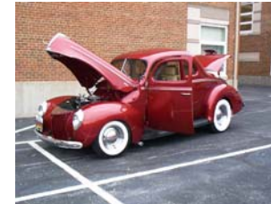
This 40 Ford Coupe is a beauty As an example of the fine autos at the show.