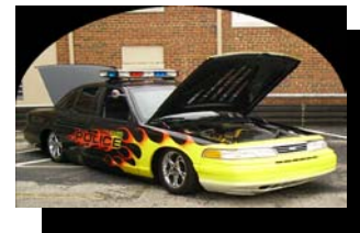
Decommissioned KCPD car One of KCPD's decommissioned patrol cars was on hand to delight young and old alike. As you may notice from the photo (above) there have been a few modifications since the cruiser was decommissioned