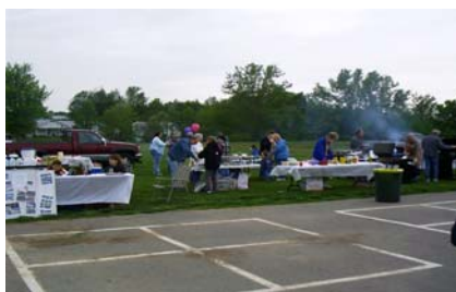
The smell of BBQ smoke drifted through the air, the tables were prepared and many desserts were brought. The Adventurers From Maple Park Baptist Church were there with sodas & water.

All the Ice was furnished by Pour Boys 17 E Us Highway 69 Claycomo, MO 64119