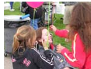
Face painting YEAH!